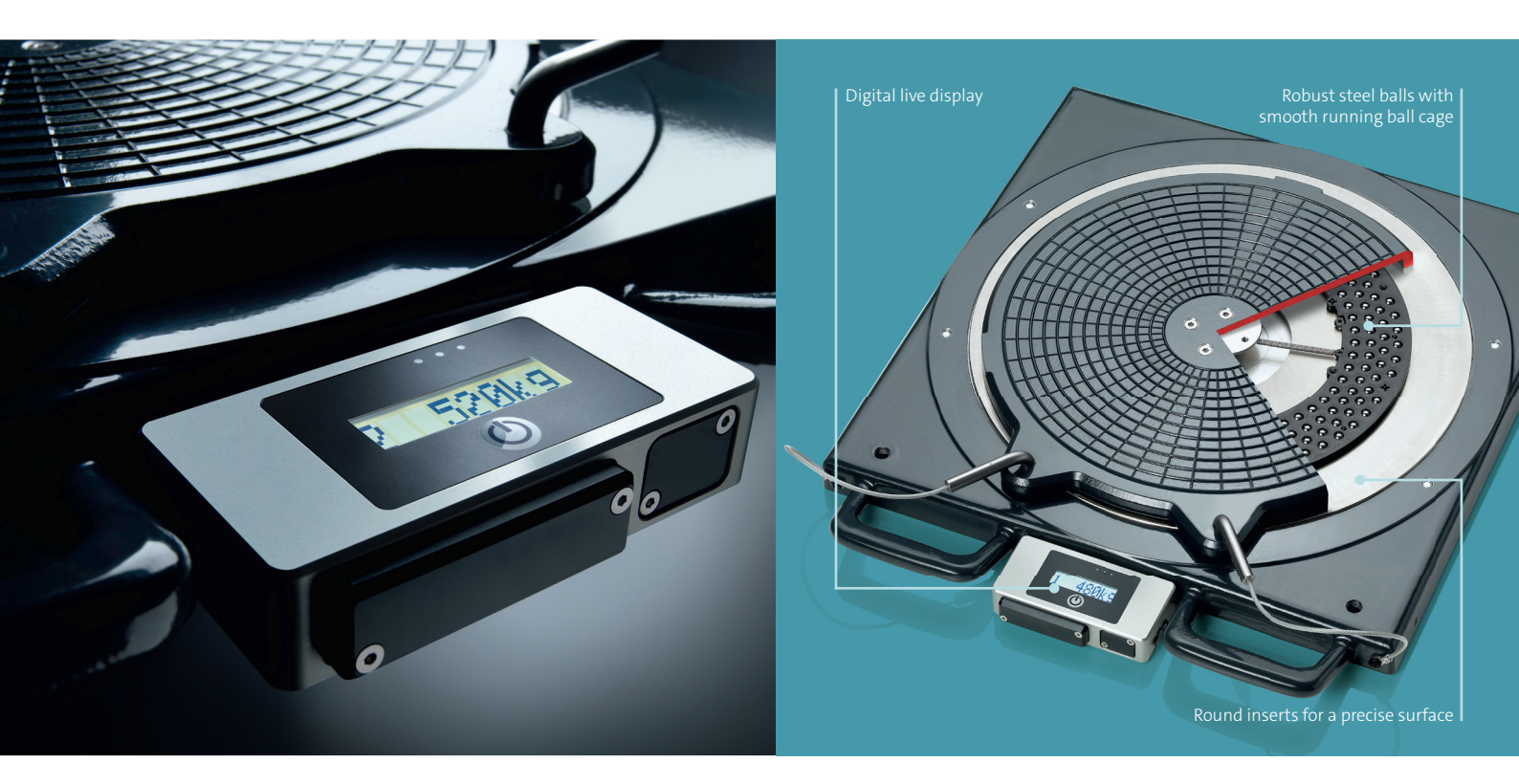
Digital corner weight scales: Turntables equipped with high-precision load cells enable weight distribution to be integrated directly into the wheel alignment.