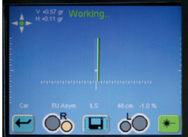
Green: If the centre line turns green, the cut-off line is within the allowed tolerances.