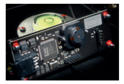
CMOS camera with high resolution and frame rate