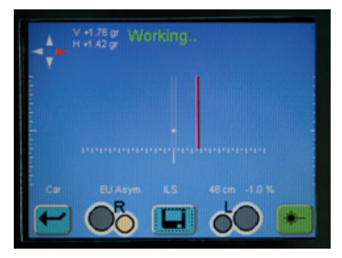
Red: Tolerance area with differing measurement line. Mechanical adjustment of the headlight is done manually.

At the MLD 815 display, a digital tolerance area is shown which allows the adjustment of the vertical cut-off line: