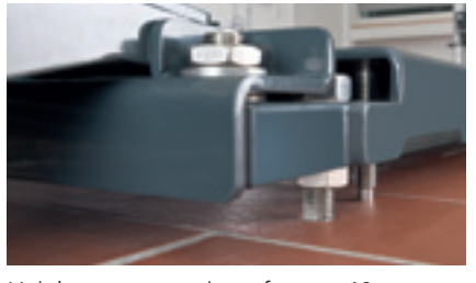
Height compensation of up to 40 mm