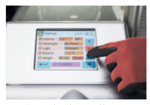
Operating panel can be rotated by 180° (operation with gloves is possible)