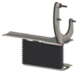
Wheel lift | for wheel balancers