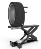
G.Zero Wheel lift | with memory function